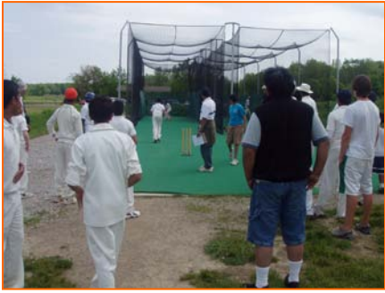
In the Nets at Lyon Oaks