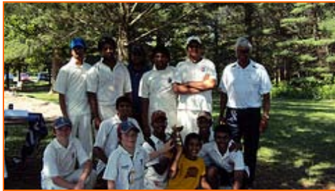
MCA - Champions, Memorial Day Tournament, 2010