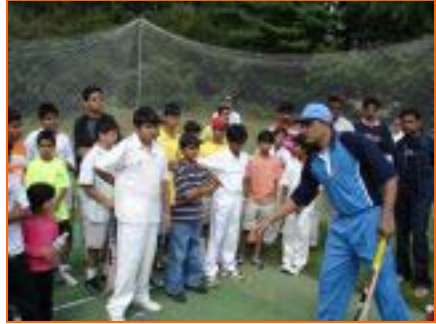
Test Star Azharuddin giving batting tips to kids